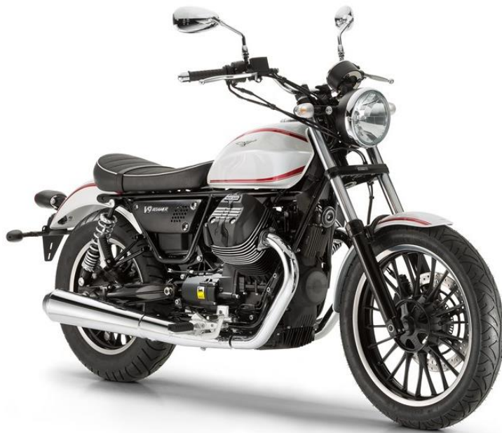
New V9 Roamer