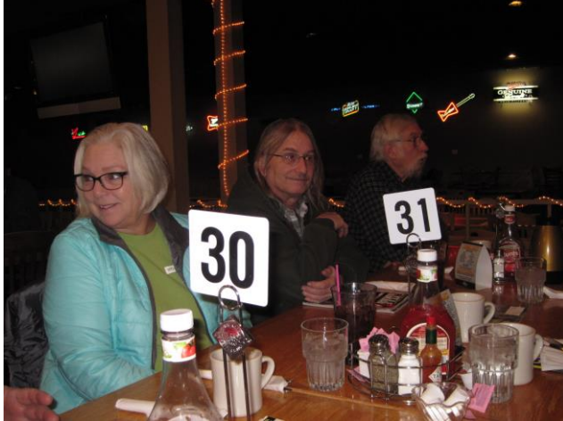
Larry goes another month without a Craig's List purchase!