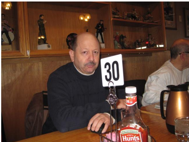
Where are the pancakes!!